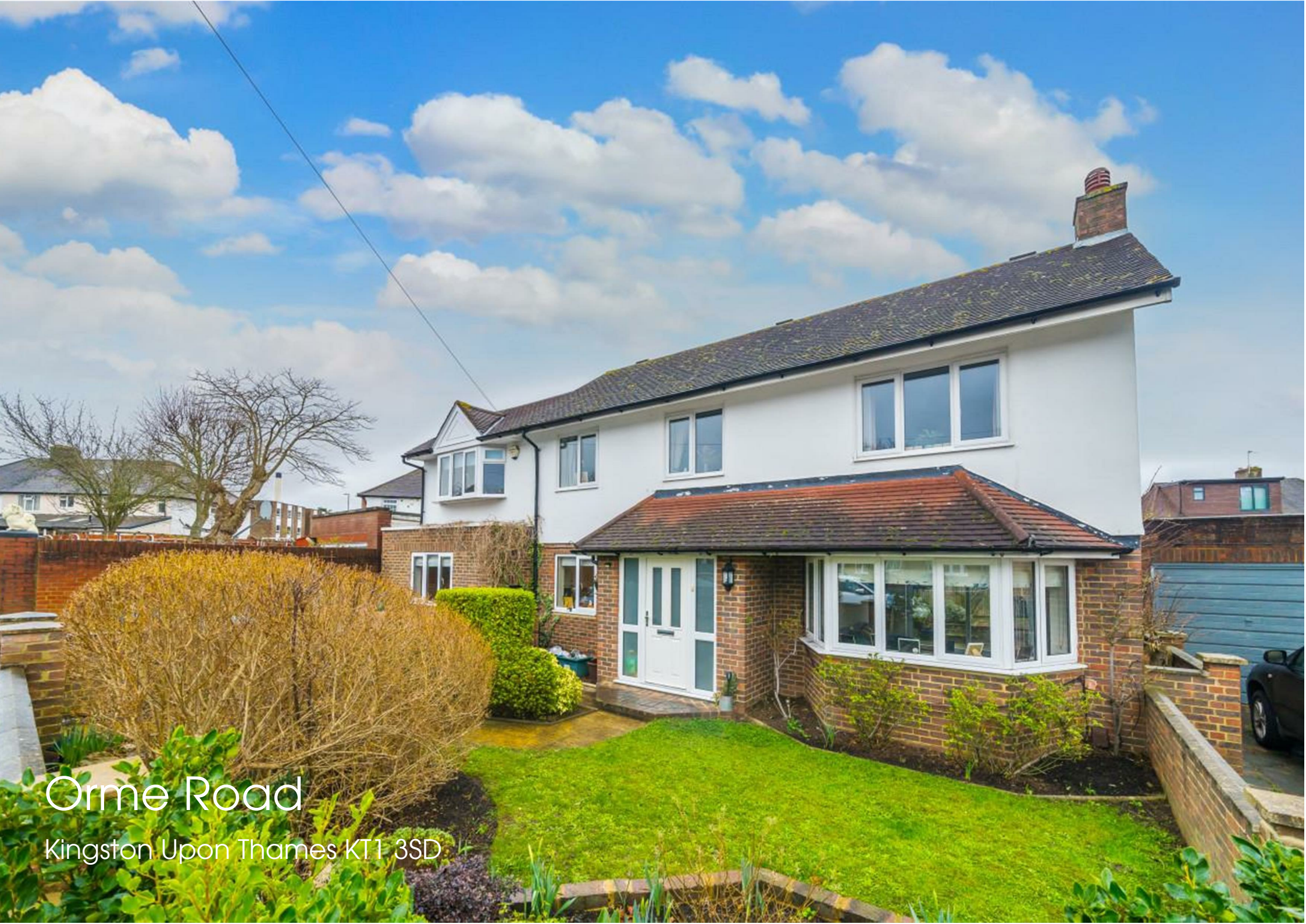
Orme Road Kingston Upon Thames KT1 3SD